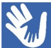
The Innisfree Foundation